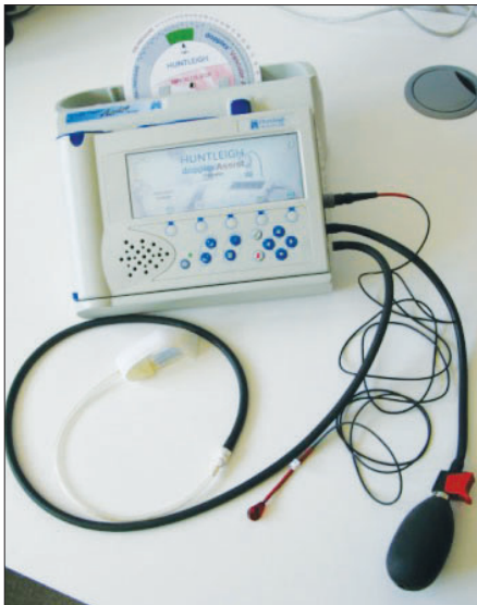
Figure 5. TBPI taken with hand-held Doppler and appropriate sized cuff.

should be used alongside either the posterior tibial pulse or peroneal pulse. Again, a reading should be taken from both legs in order to attain a picture of the person's whole arterial system, with the highest foot pulse in each leg being used for the measurement.