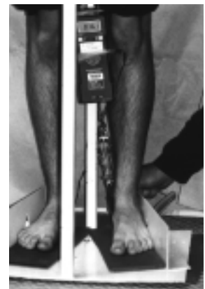
Figure 6: The supination resistance device used to measure the amount of force needed to supinate the rearfoot.

The composite FPI score was correlated to changes in frontal plane angle and navicular height with the six different devices. In addition 3 of the 8 items that make up the FPI (calcaneal inverted/everted, bulging in the region of the talonavicular joint and congruence of the medial longitudinal arch) were also used to correlate to changes with the foot orthoses. These three were chosen as they are assumed to represent positions of the foot in the frontal plane (calcaneal inversion/eversion), sagittal plane (medial longitudinal